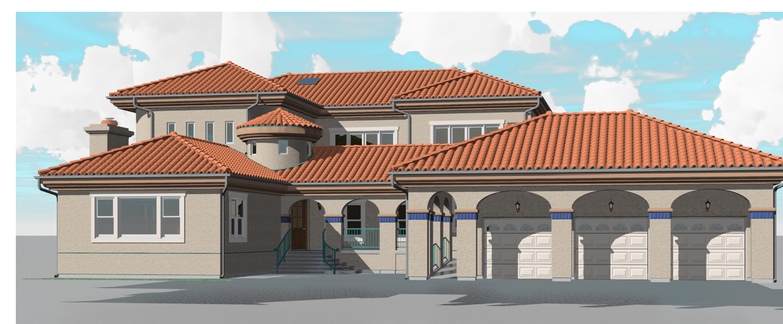
Perspective View South-East