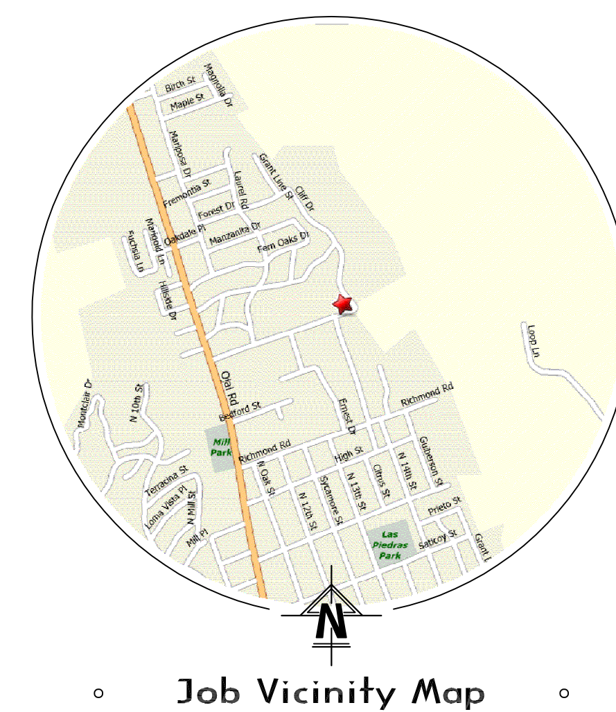
Job Vicinity Map